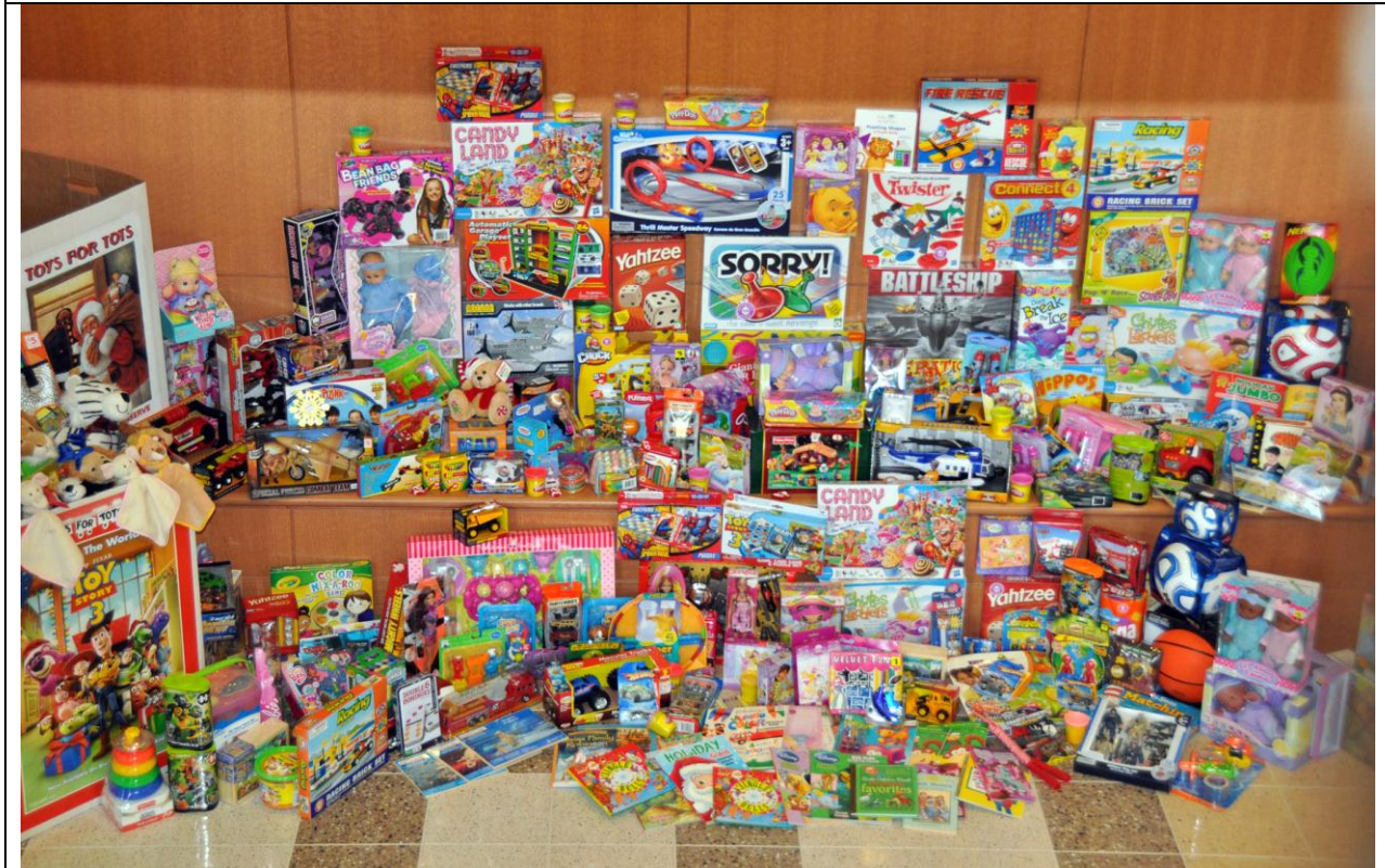
Franklin P. Perdue School of Business

As your editor I wish I could publish ALL the pictures I have received and acknowledge at least some of those that made the 2011 Toys-For-Tots Program the huge success that it was on the Eastern Shore but space in "The Scuttlebutt" is limited as I need to hold the newsletter down to 6 pages a month. BUT, as your Web-Sergeant I do have a second option available to me and that is on our web-site. More pictures can be viewed on the following link. http://www.mcltreacoheedet115.org/T4T.htm